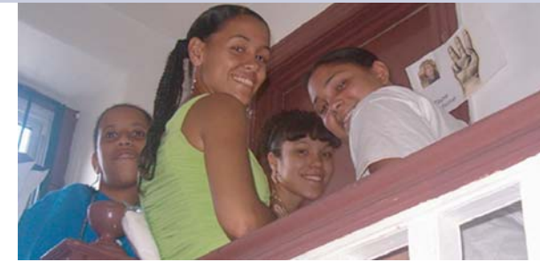
Youth participate in a technology scavenger hunt.